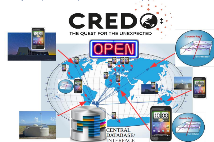
Fig. 3.: the CREDO concept. More info is given in this review .

Global network of CREDO detectors: investigation of large scale cosmic-ray correlations in the form of widely defined CRE require a global approach to cosmic-ray research. The role of CREDO can be understood as an umbrella research program that enables a collaborative effort dedicated to CRE with the use of existing infrastructure and expertise, and with openness for designing and building complementary detectors or arrays.