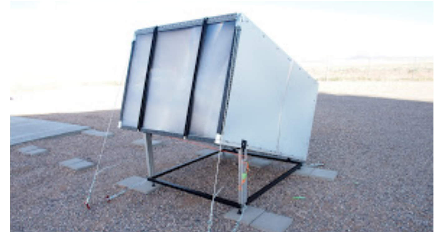
Fig1. Exterior of CRAFFT detector which consists of Fresnel lens, UV trans. Filter, 8 inc. PMT, FADC.