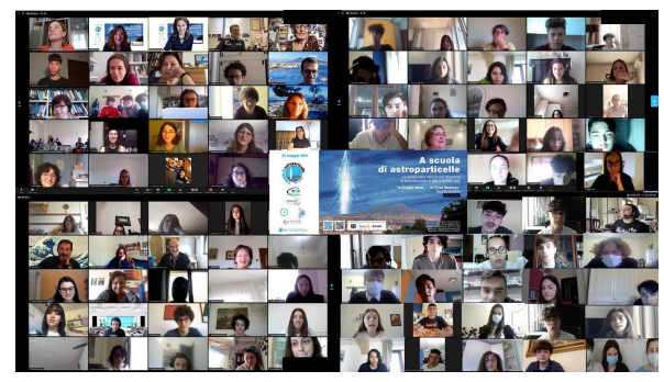
Students, teachers and tutors in Zoom connection during the final event of the special fourth online edition.

We tested that "A scuola di Astroparticelle" is a valid tool for school and personal growth of young students. In the next years, we will continue to propose this project as PCTO and to expand the available research paths.