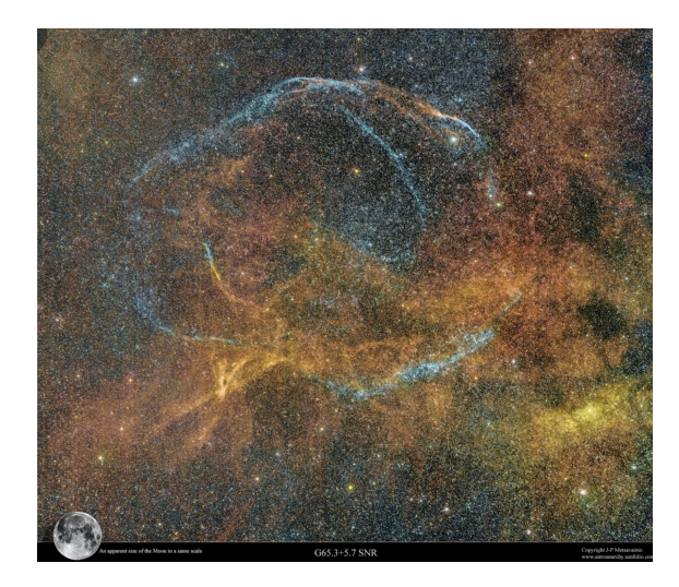
Figure 2: SNR G65.3+5.7, credit tbd.